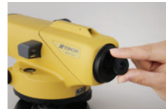
40x Eyepiece EL5 (AT-B2)