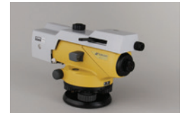
Optical Micrometer OM5 (AT-B2)