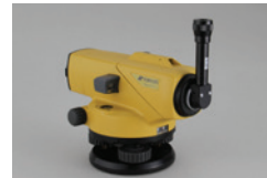
Diagonal Eyepiece DE16 (AT-B2)